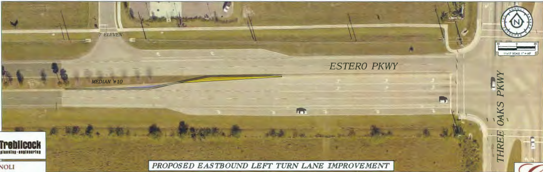
PROPOSED EASTBOUND LEFT TURN LANE IMPROVEMENT