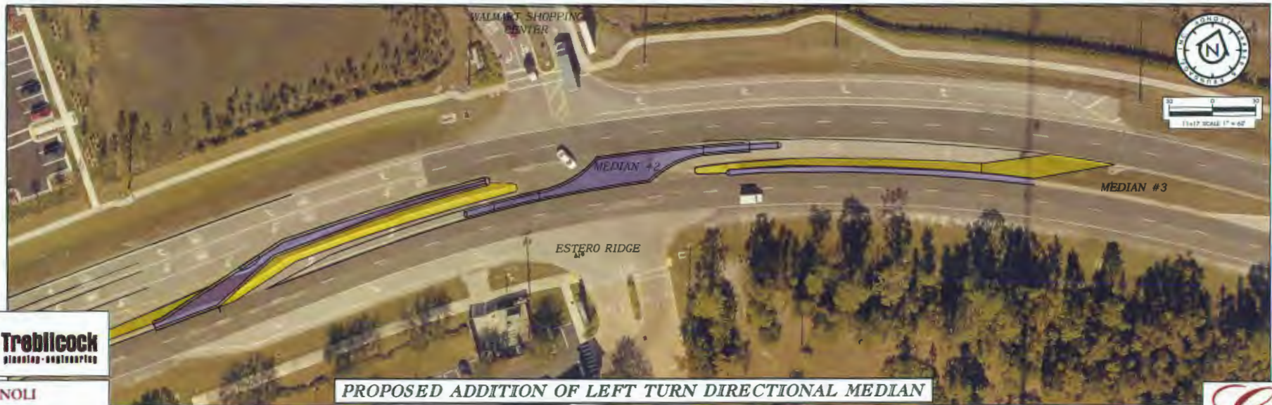
PROPOSED ADDITION OF LEFT TURN DIRECTIONAL MEDIAN