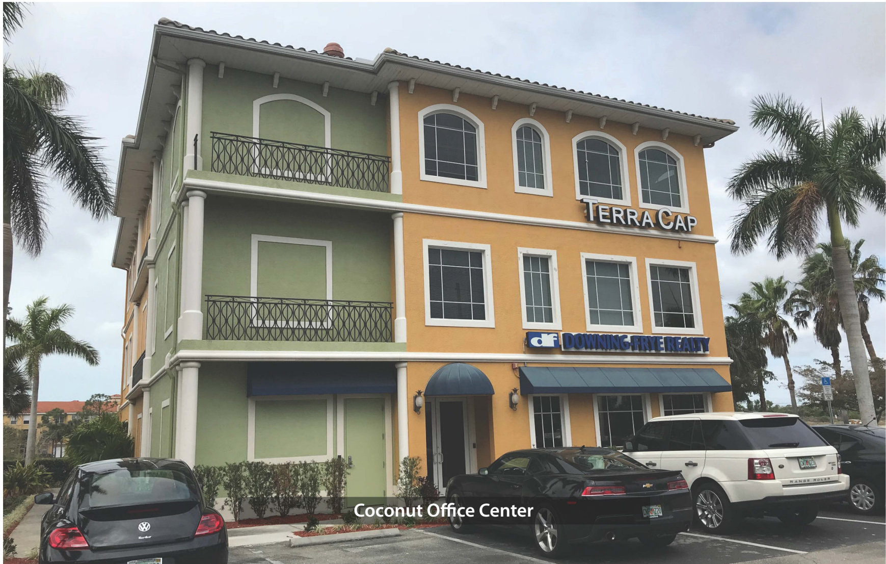
Coconut Office Center