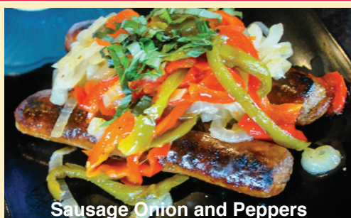
Sausage Onion and Peppers