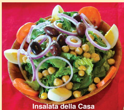
Insalata della Casa

Oven baked sandwiches available with a side Italian dressing, mayonnaise or pesto mayonnaise.