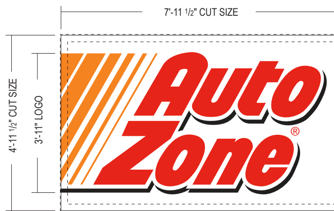
LEXAN FACE LAYOUT SCALE: 3/8"=1'-0"