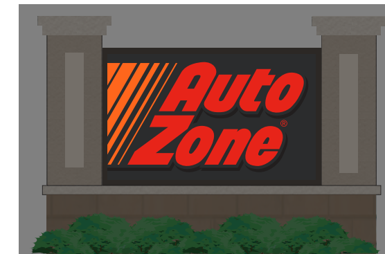
NIGHT VIEW SCALE: N.T.S.