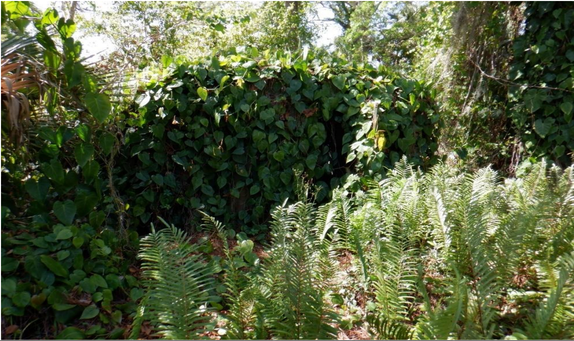
Photo 9: Structure 3 – 8741 Corkscrew Road 33928 – Hidden metal shed approximately 50 ft 2