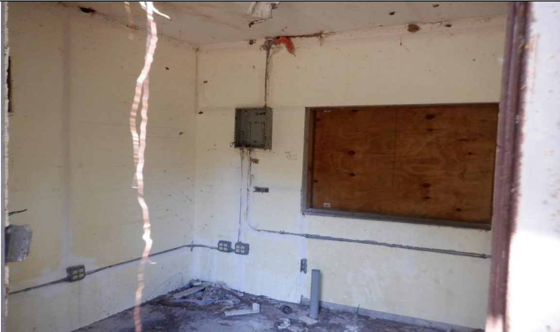
Photo 12: Structure 4 – Interior view of Concrete Block Shed Pumphouse approximately 50 ft 2

Title: Site Photographs – 20-032751-IAQ/AS