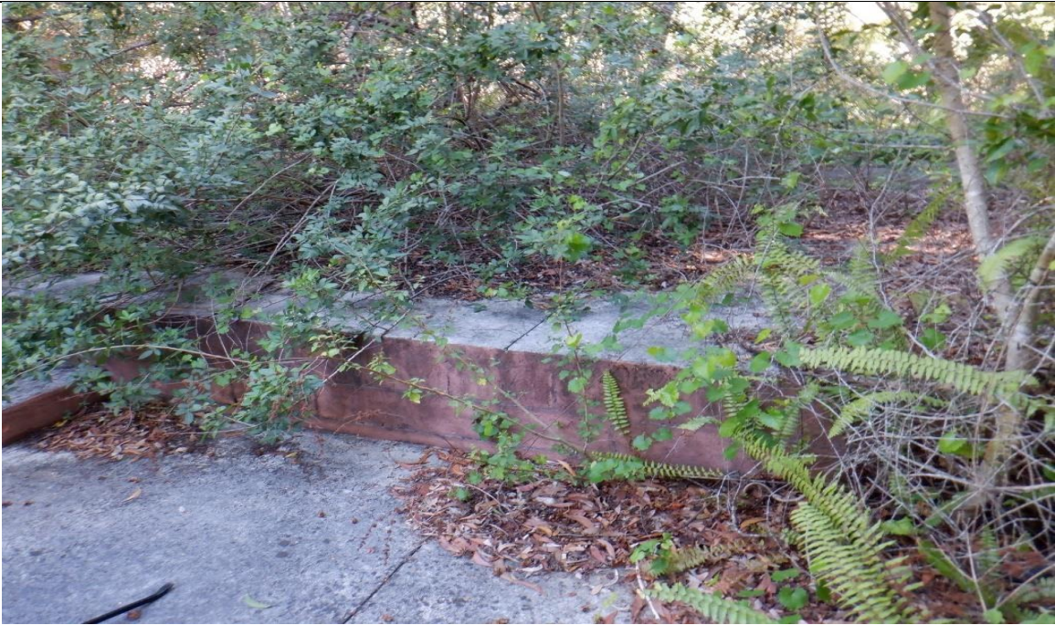
Photo 14: Structure 5 Concrete Slab (Stage) approximately 625 ft 2

Title: Site Photographs – 20-032751-IAQ/AS