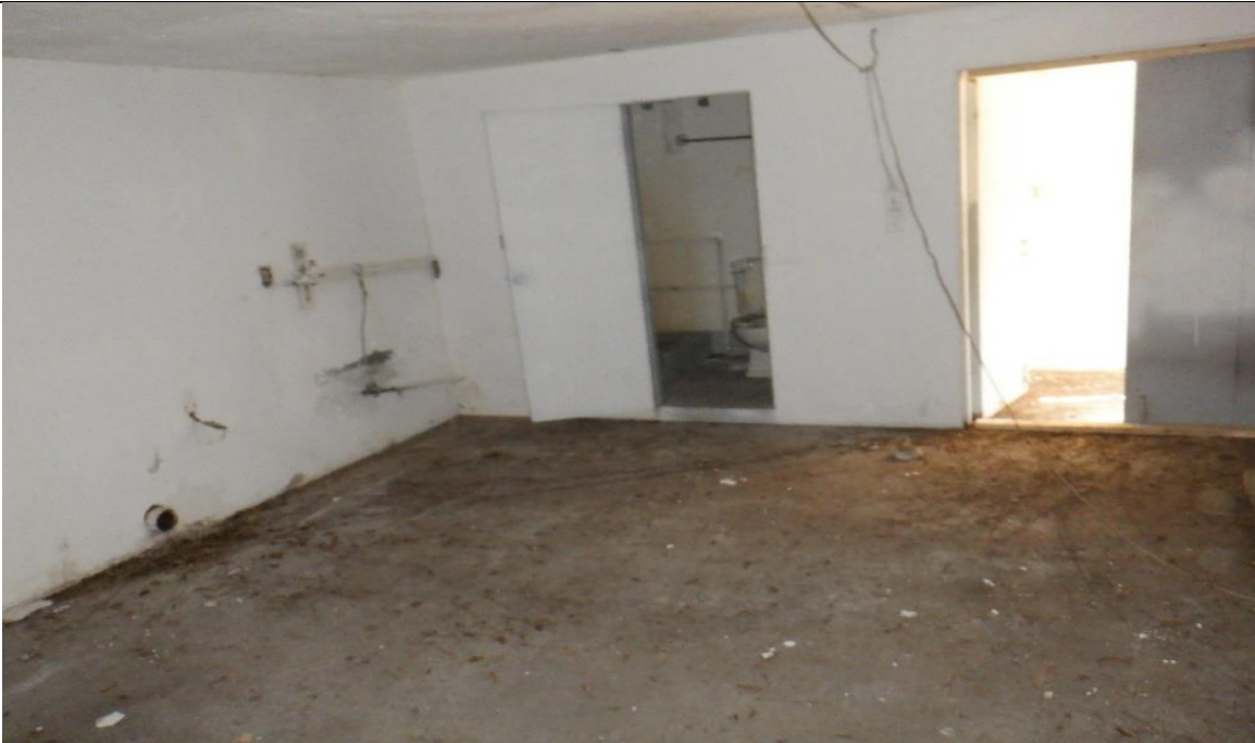
Photo 16: Structure 6 – Interior view of concrete aboveground bomb shelter approximately 400 ft 2

Title: Site Photographs – 20-032751-IAQ/AS