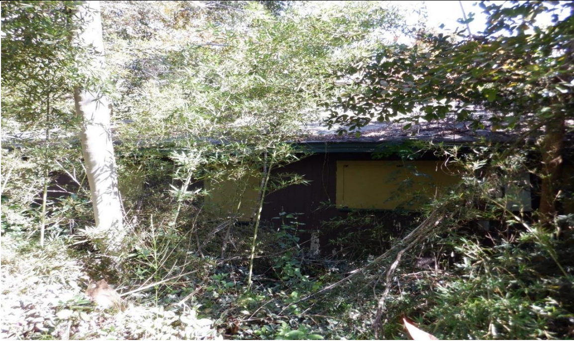
Photo 19: Structure 7 - 8761 Corkscrew Road 33928 – Front view of the one (1) story wood framed house.