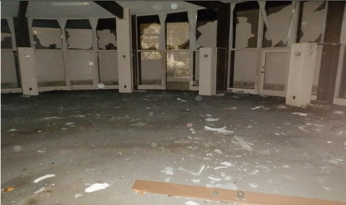
Photo 4: Structure 1 - 8661 Corkscrew Road 33928 – Interior of two (2) story building.

Title: Site Photographs – 20-032751-IAQ/AS