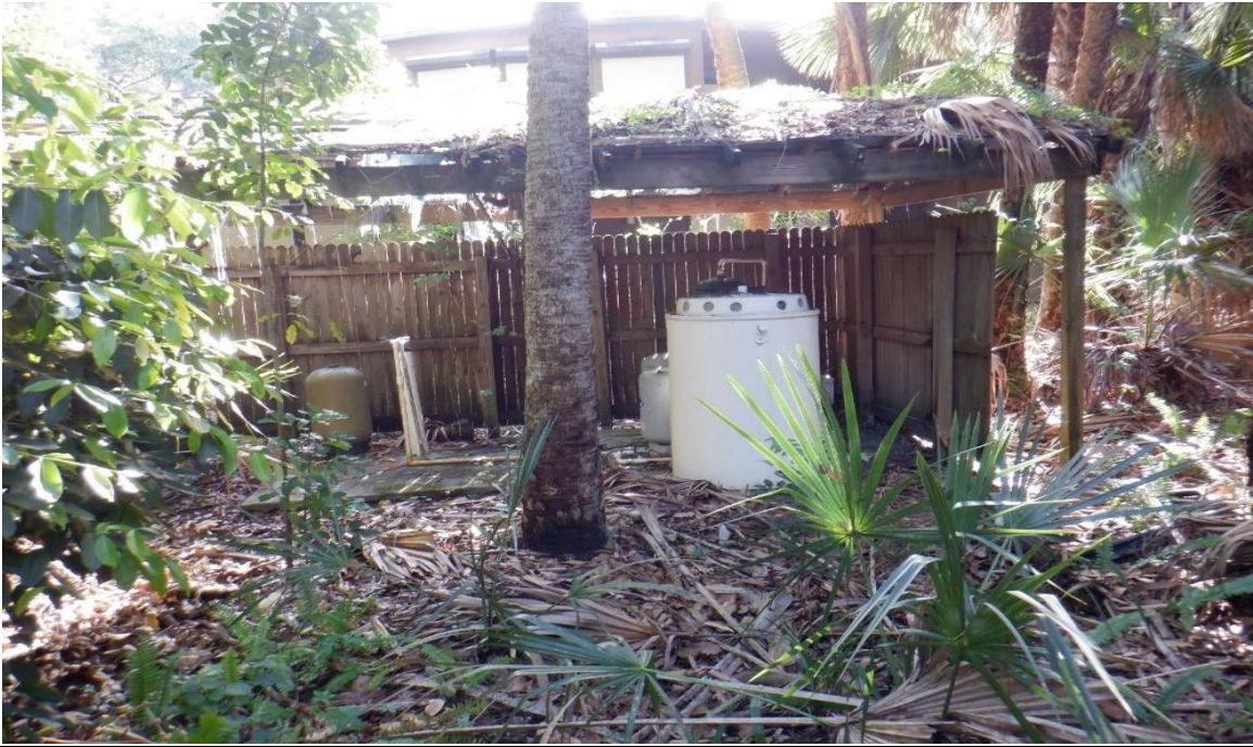
Photo 3: Structure 1 - 8661 Corkscrew Road 33928 – Woodshed for well and water equipment.