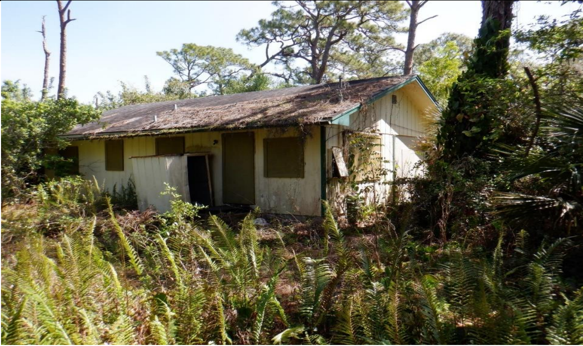
Photo 7: Structure 3 – 8741 Corkscrew Road 33928 – One (1) story wood framed house approximately 900 ft 2