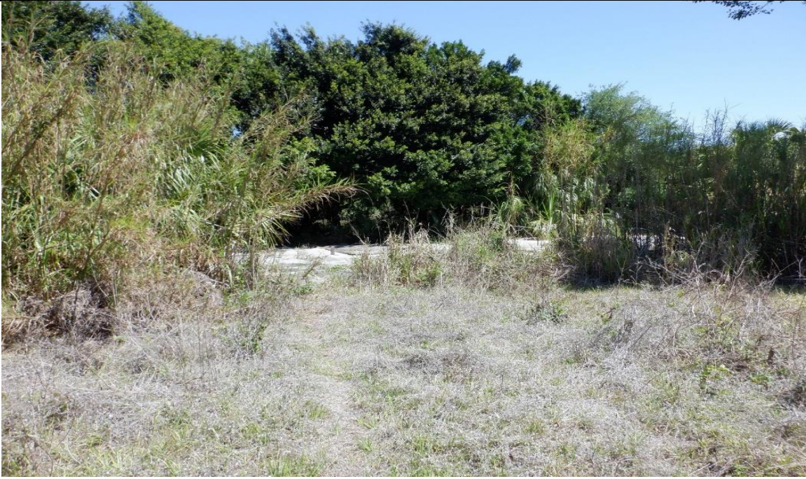
Photo 27: Structure 11 – 20911 Highlands Avenue 33928 – Concrete slab approximately 1,300 ft 2