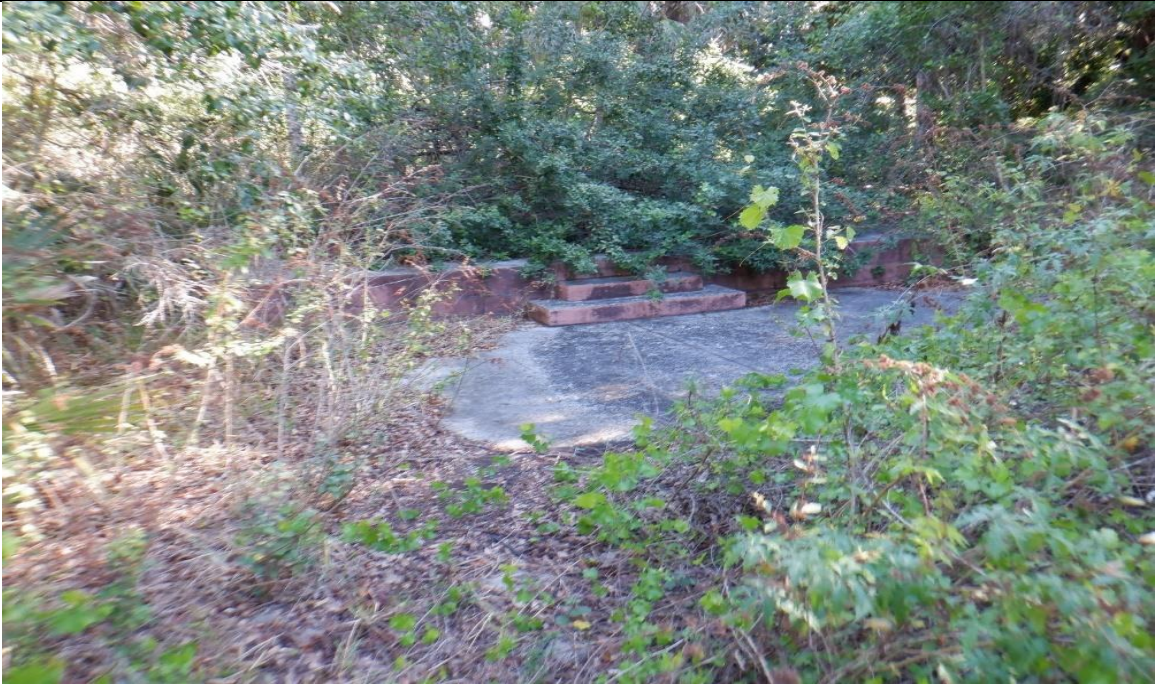
Photo 13: Structure 5 - Concrete Slab (Stage) approximately 625 ft 2