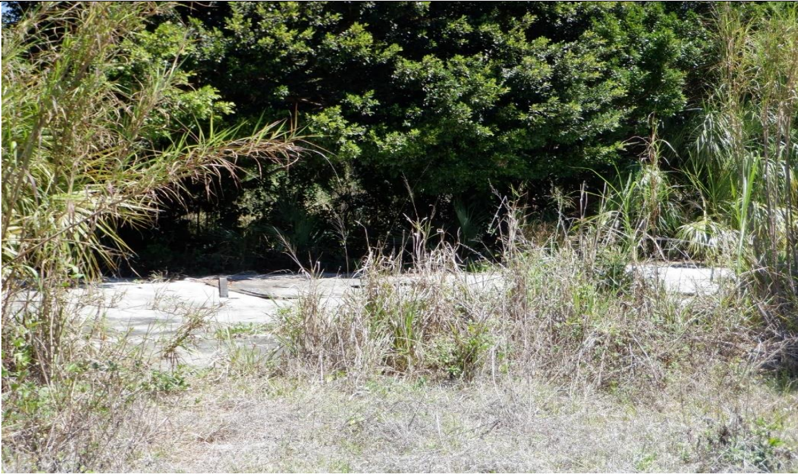
Photo 28: Structure 11 - 20911 Highlands Avenue 33928 – Concrete slab approximately 1,300 ft 2

Title: Site Photographs – 20-032751-IAQ/AS