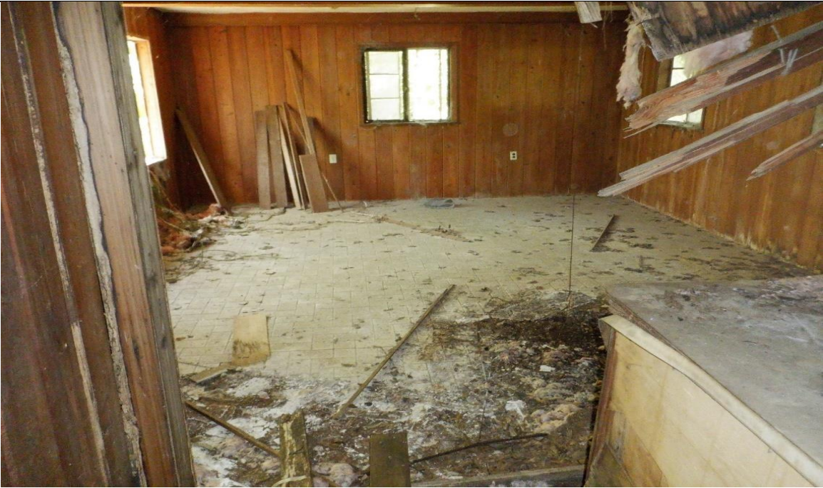
Photo 24: Structure 9 - Interior view of one (1) story residential structure.

Title: Site Photographs – 20-032751-IAQ/AS