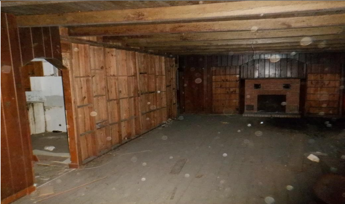
Photo 20: Structure 7 - 8761 Corkscrew Road 33928 – Interior view of the one (1) story wood framed house.

Title: Site Photographs – 20-032751-IAQ/AS