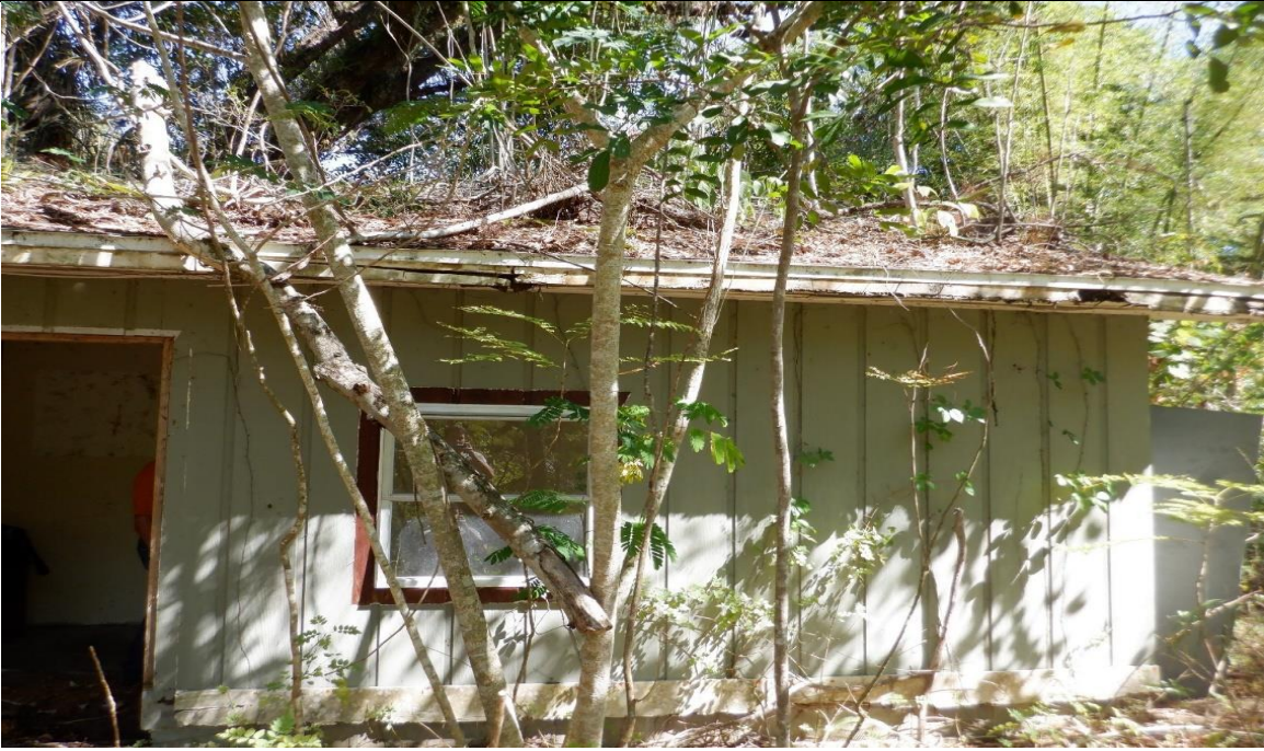
Photo 23: Structure 9 – One (1) story residential structure, wood framed, and addition is on a concrete slab.