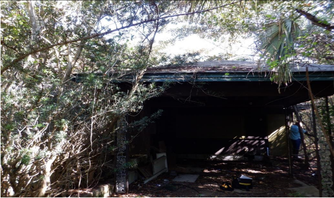
Photo 17: Structure 7 – 8761 Corkscrew Road 33928 – One (1) story wood framed house & concrete slab garage.