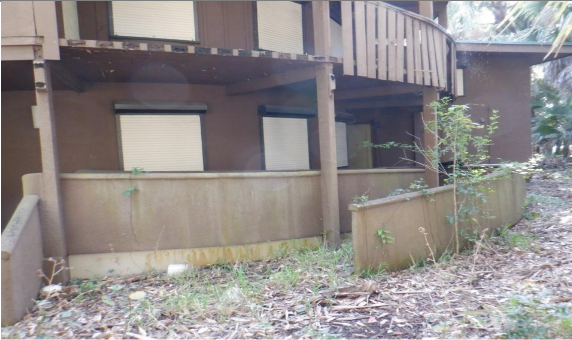
Photo 2: Structure 1 - 8661 Corkscrew Road 33928 – Rear of two (2) story building.

Title: Site Photographs – 20-032751-IAQ/AS