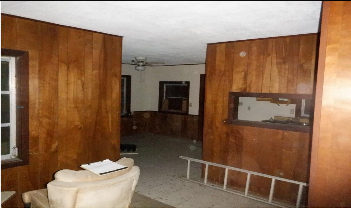
Photo 8: Structure 3 – 8741 Corkscrew Road 33928 – Interior view of the one (1) story wood framed house approximately 900 ft 2

Title: Site Photographs – 20-032751-IAQ/AS