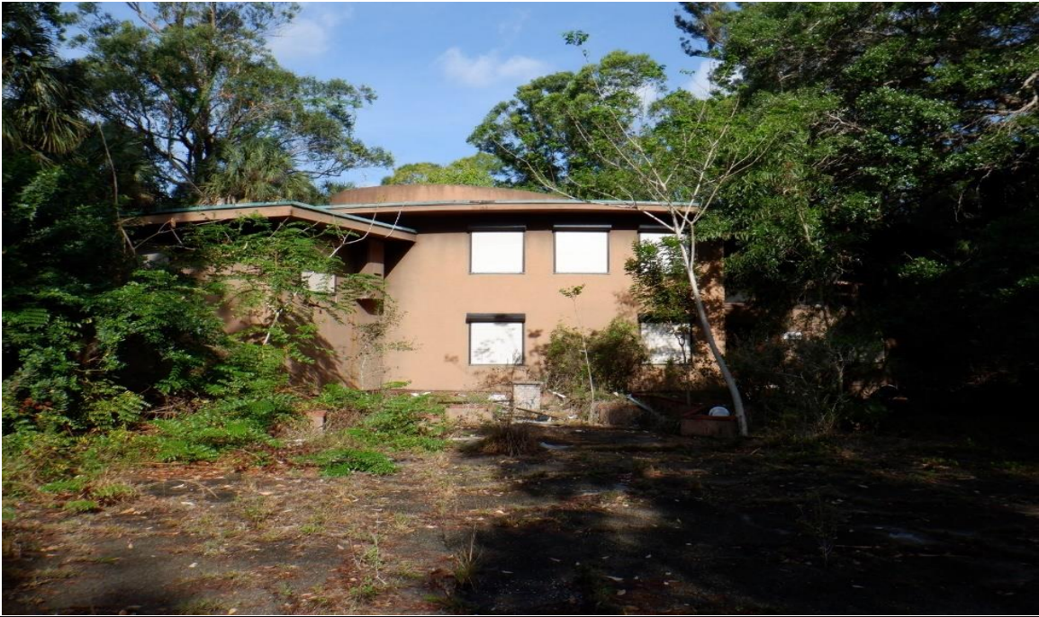
Photo 1: Structure 1 – 8661 Corkscrew Road 33928 – Front of two (2) story building.