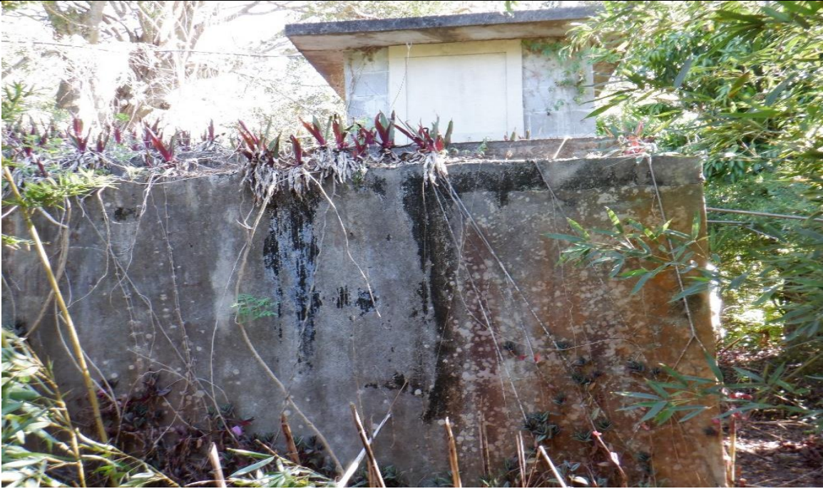
Photo 15: Structure 6 – Concrete aboveground bomb shelter approximately 400 ft 2