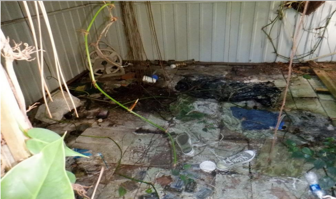
Photo 10: Structure 3 – 8741 Corkscrew Road 33928 - Interior view of hidden shed approximately 50 ft 2

Title: Site Photographs – 20-032751-IAQ/AS