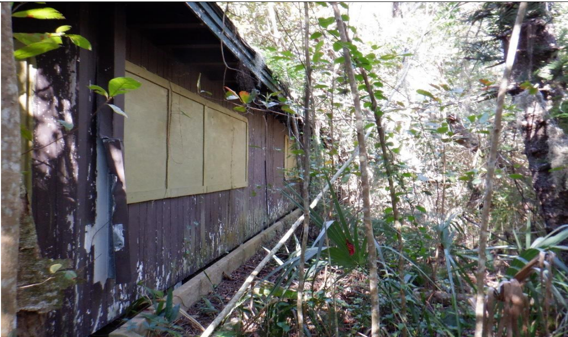
Photo 18: Structure 7 - 8761 Corkscrew Road 33928 – Side view of the one (1) story wood framed house.

Title: Site Photographs – 20-032751-IAQ/AS