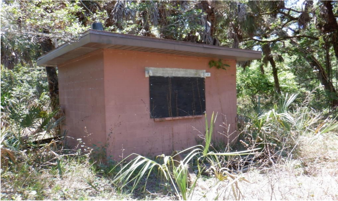
Photo 11: Structure 4 – Concrete Block Shed Pumphouse approximately 50 ft 2