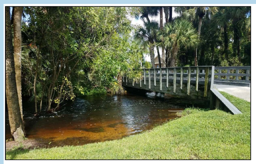
Figure 4-4: Estero River, North Branch (August 28, 2017)

Figure 4-3: Country Creek Drive, Looking North (August 28, 2017)