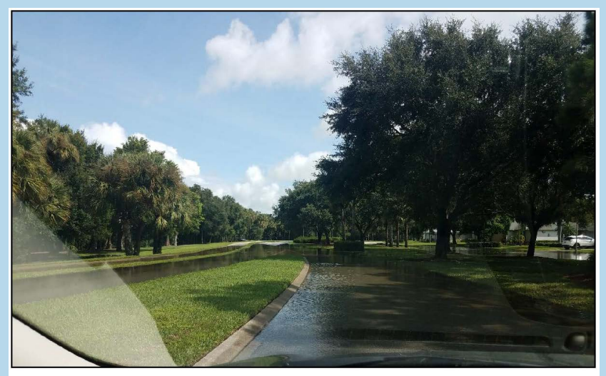
Figure 4-3: Country Creek Drive, Looking North (August 28, 2017)