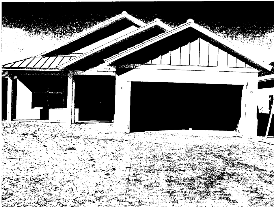
REAR VIEW (04-07-2016)