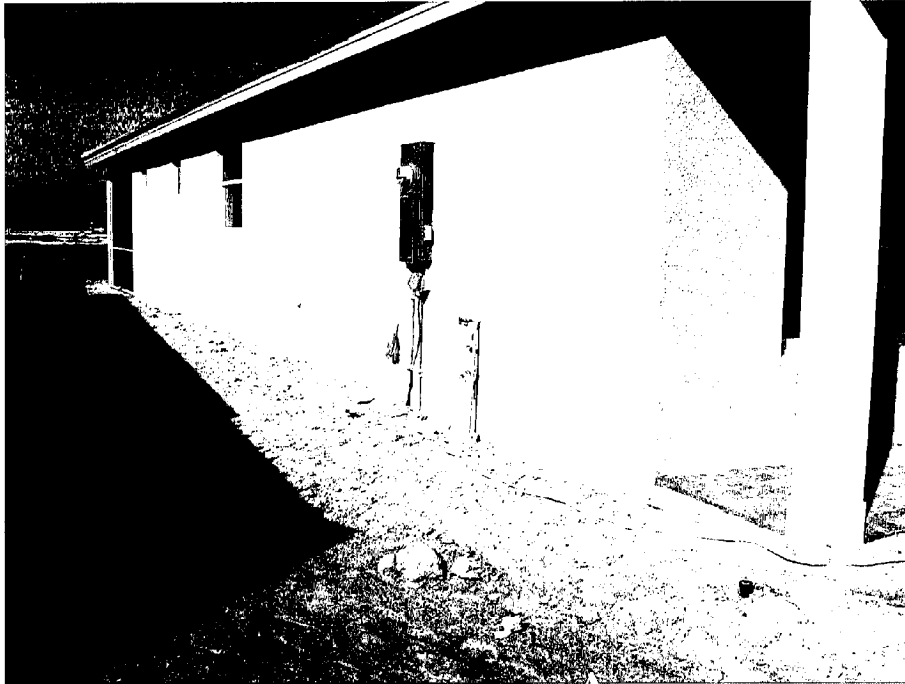
SIDE VIEW (04-07-2016)