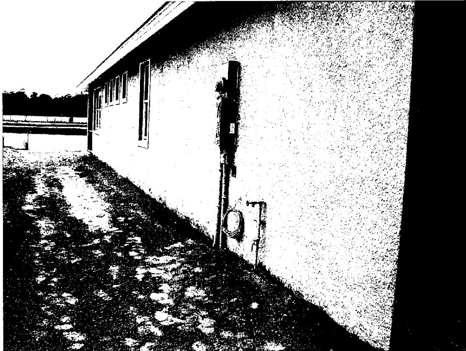
SIDE VIEW (03-22-2016)