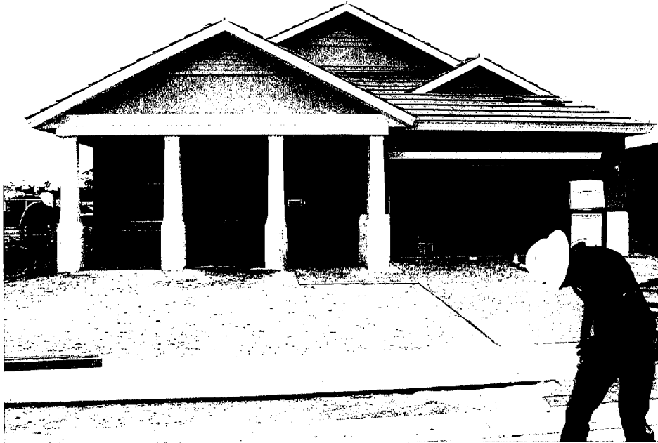
REAR VIEW (03-22-2016)