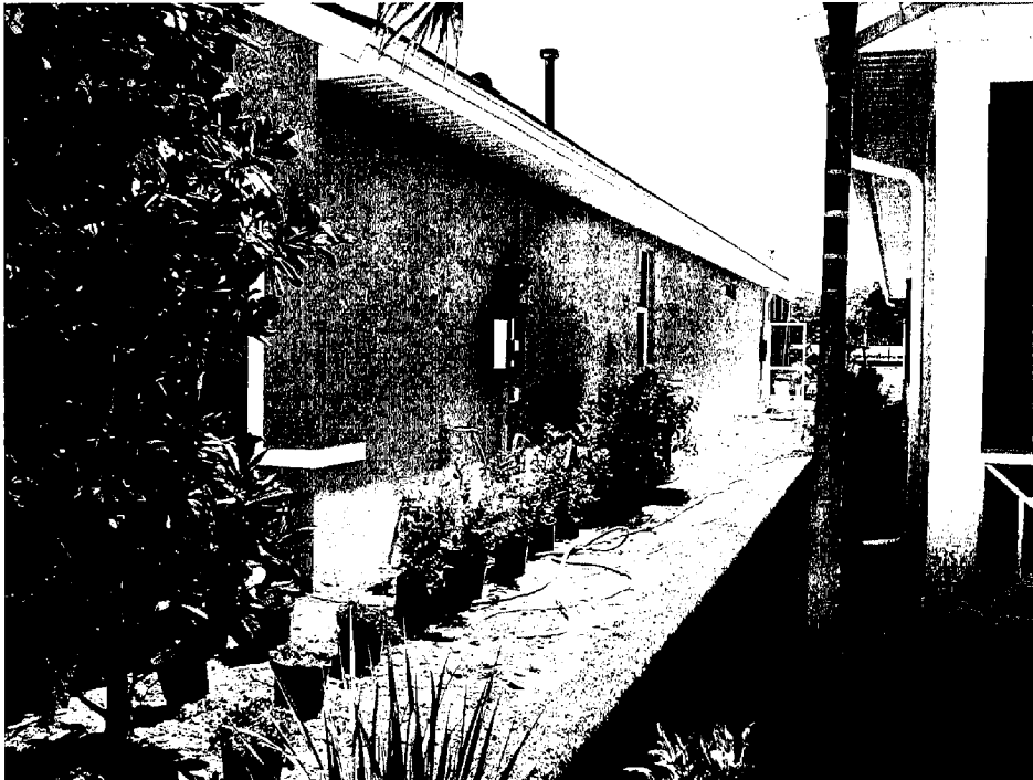
SIDE VIEW (06-01-2016)