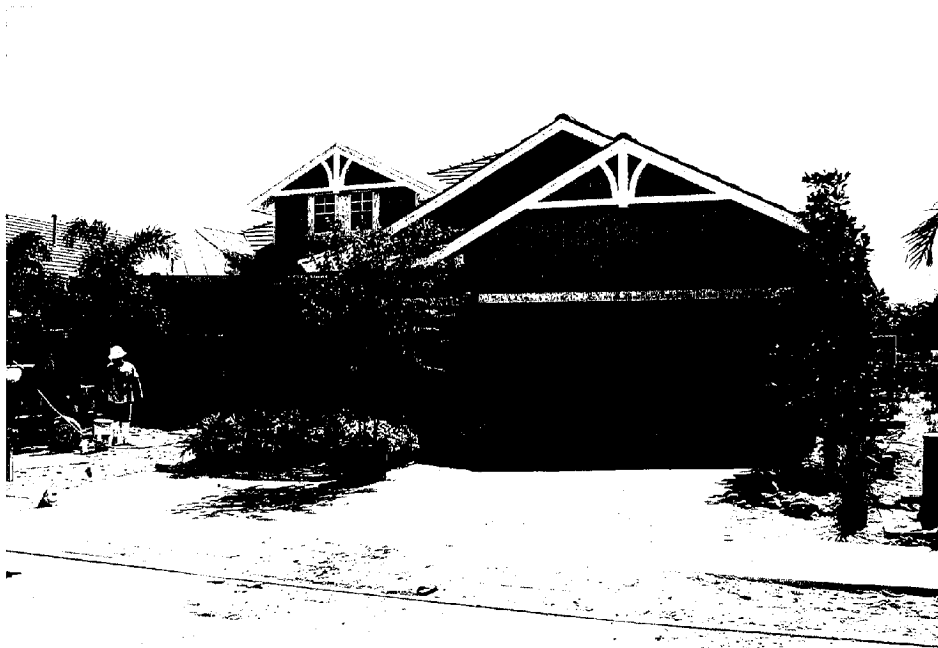
REAR VIEW (06-03-2016)