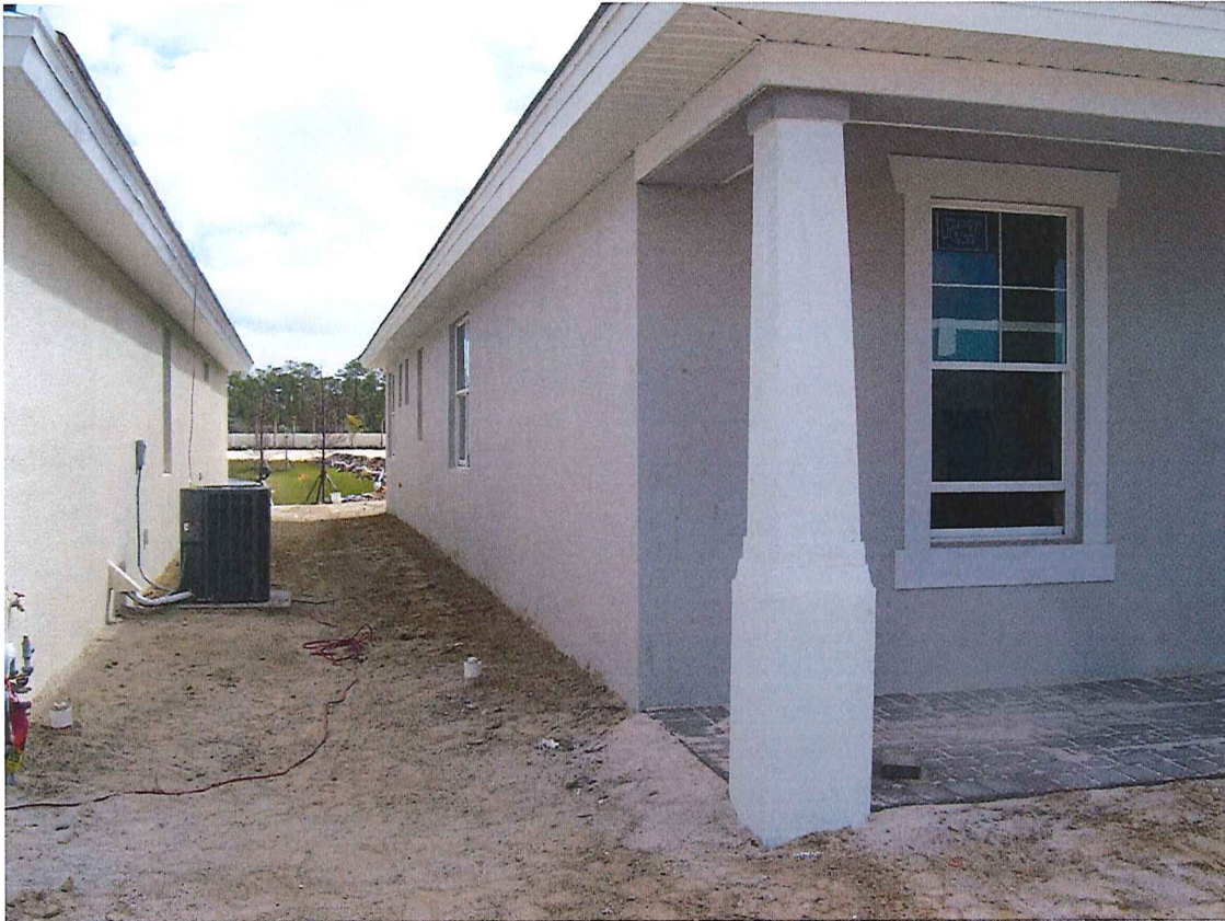
SIDE VIEW (03-10-016)