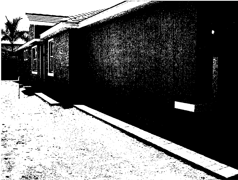
SIDE VIEW (03-30-2016)