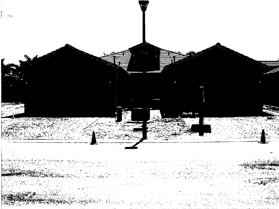
REAR VIEW (03-30-2016)