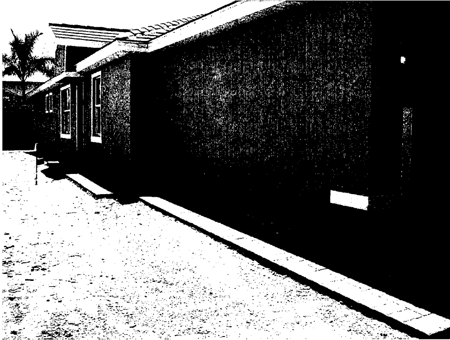
SIDE VIEW (03-30-2016)