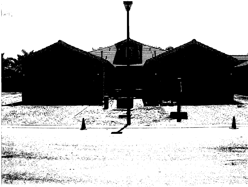
REAR VIEW (03-31-2016)