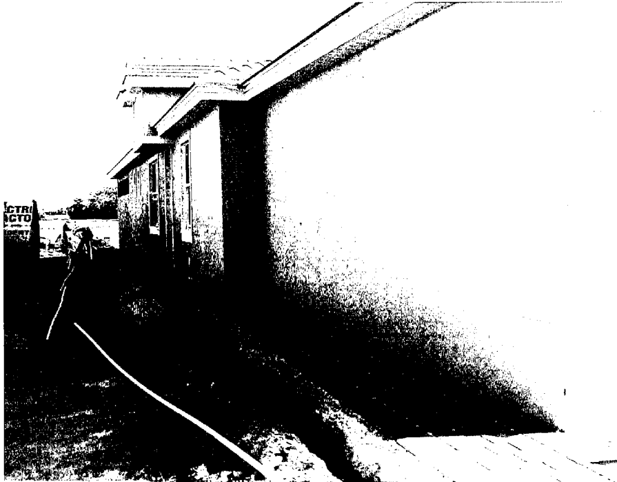
SIDE VIEW (04-11-2016)