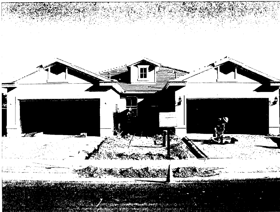
REAR VIEW (04-11-2016)