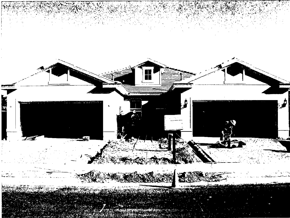
REAR VIEW (04-11-2016)