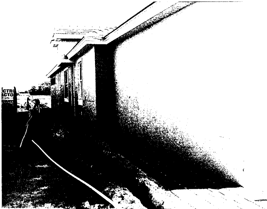
SIDE VIEW (04-11-2016)