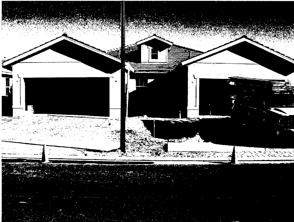
REAR VIEW (04-19-2016)