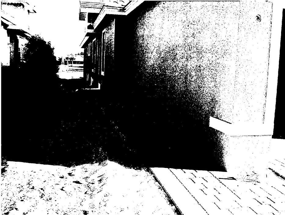
SIDE VIEW (04-19-2016)