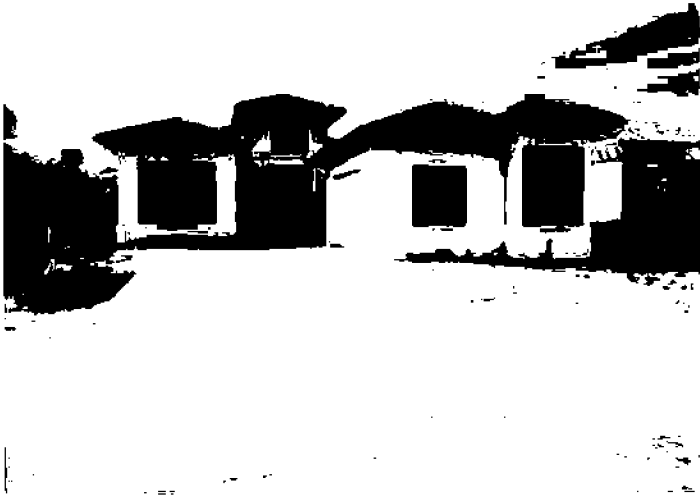
Front View Date Taken: 02-08-16