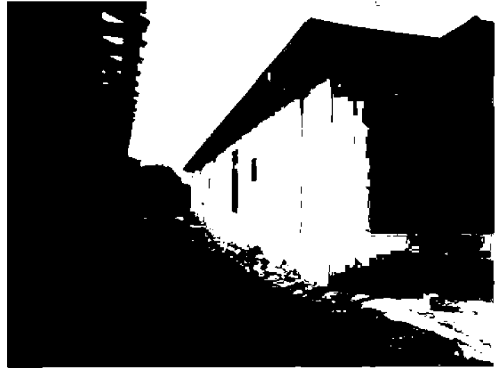
Left Side View Date Taken: 02-08-16