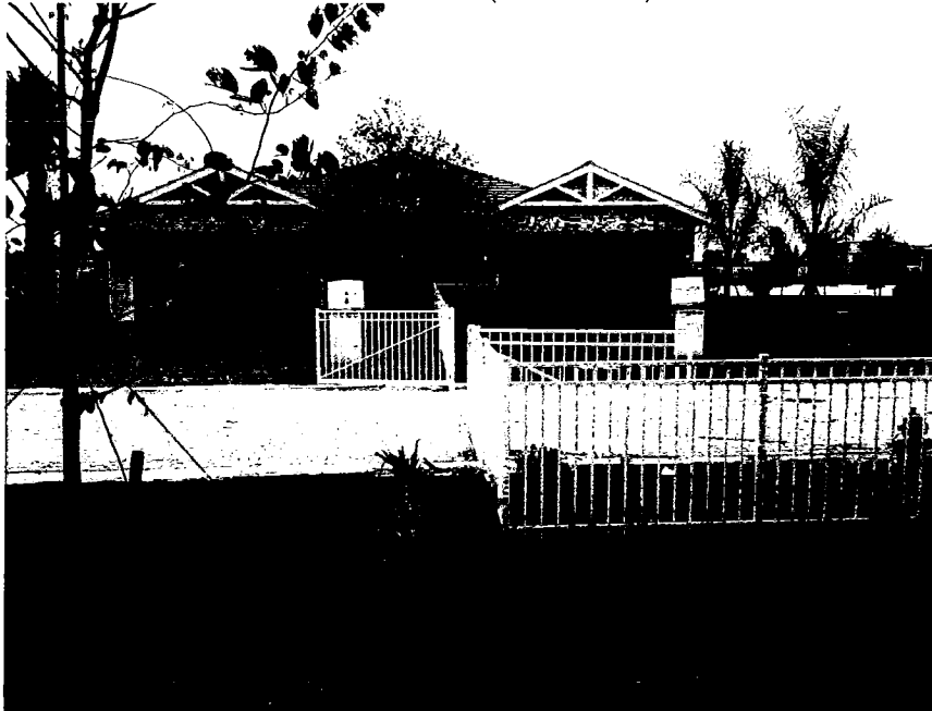
REAR VIEW (11-10-2015)