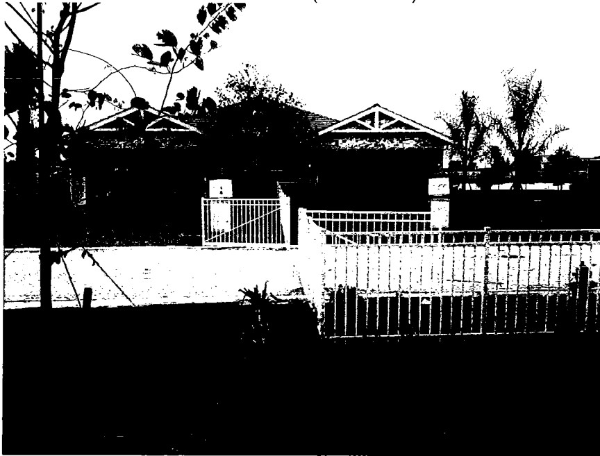
REAR VIEW (11-10-2015)