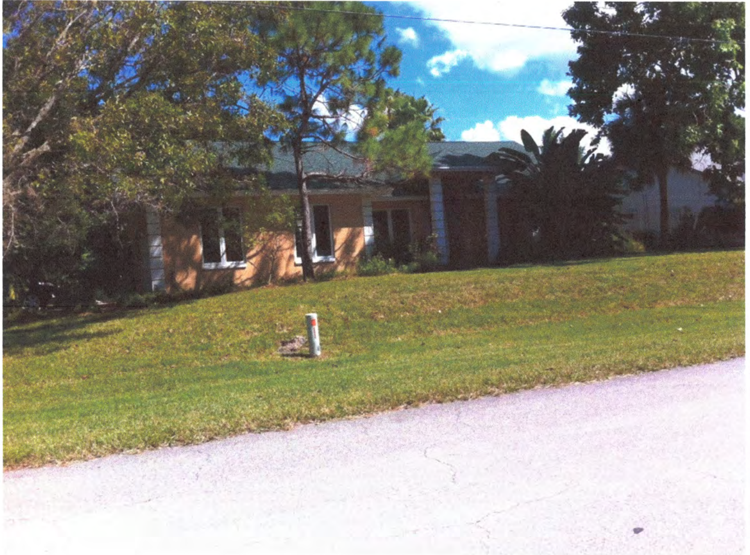
FRONT VIEW 10/1/13

If using the Elevation Certificate to obtain NFIP flood insurance, affix at least 2 building photographs below according to the instructions for Item A6. Identify all photographs with date taken; "Front View" and "Rear View"; and, if required, "Right Side View" and "Left Side View." When applicable, photographs must show the foundation with representative examples of the flood openings or vents, as indicated in Section A8. If submitting more photographs than will fit on this page, use the Continuation Page.