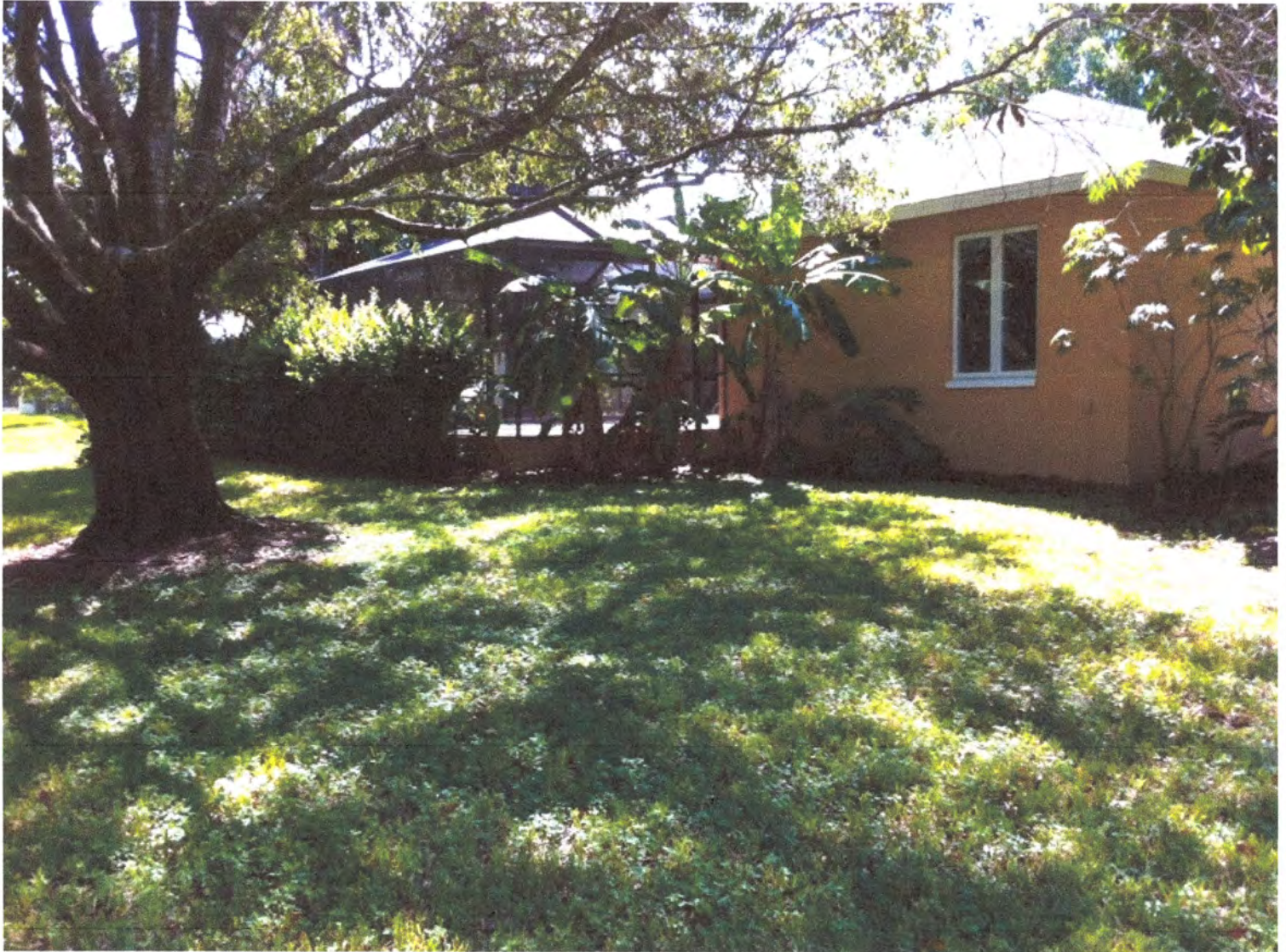
REAR VIEW 10/1/13

If submitting more photographs than will fit on the preceding page, affix the additional photographs below. Identify all photographs with: date taken; "Front View" and "Rear View"; and, if required, "Right Side View" and "Left Side View." When applicable, photographs must show the foundation with representative examples of the flood openings or vents, as indicated in Section A8.