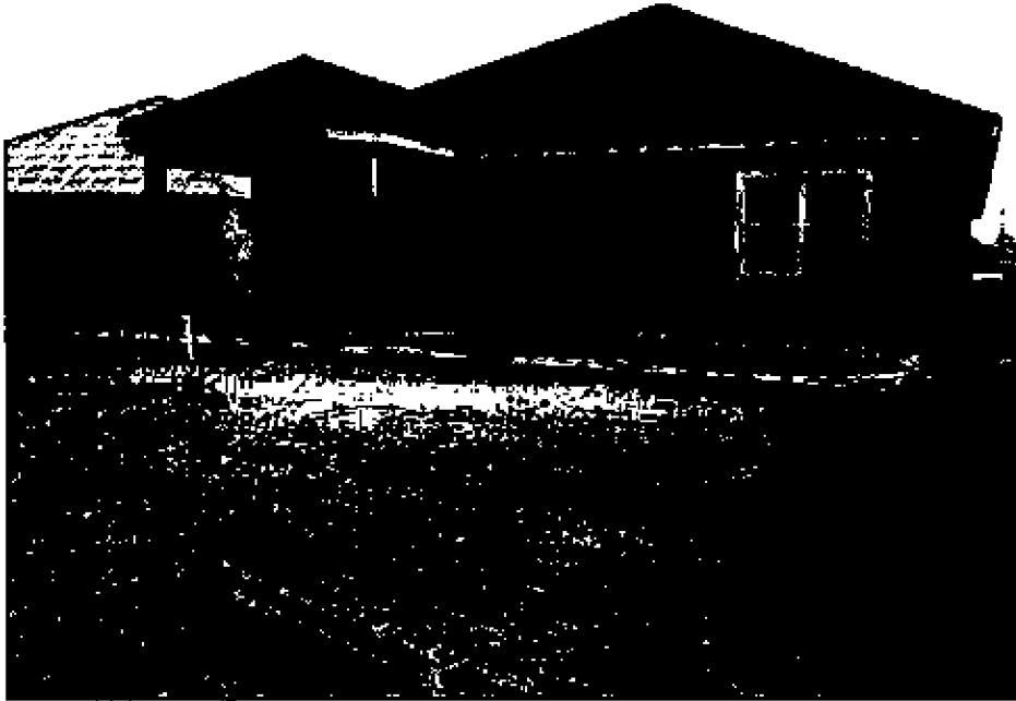
LEFT SIDE VIEW 9/16/15