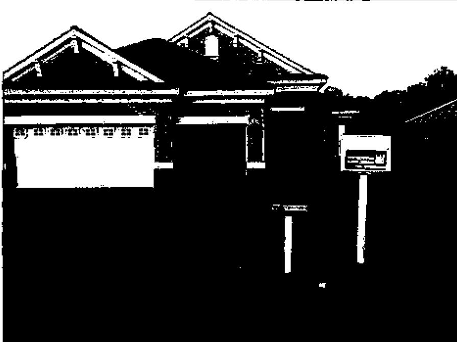
RIGHT SIDE VIEW 9/16/15