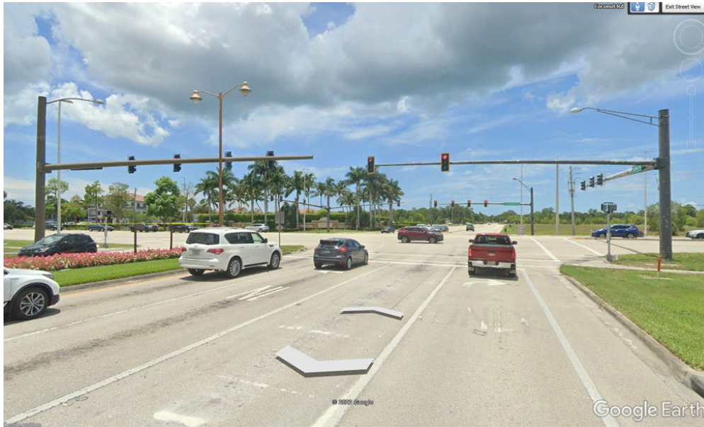
Mast Arm Assemblies at Coconut Rd and US-41, looking West

blasting impacts, solvent/paint overspray/dripping, etc.) to vehicles passing through the intersection during work operations.